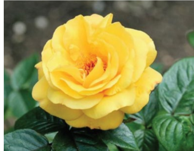
Yellow Bush Rose seeds available at ufseeds.com

Check out our Rose seed selection on our website at <u>ufseeds.com!</u>