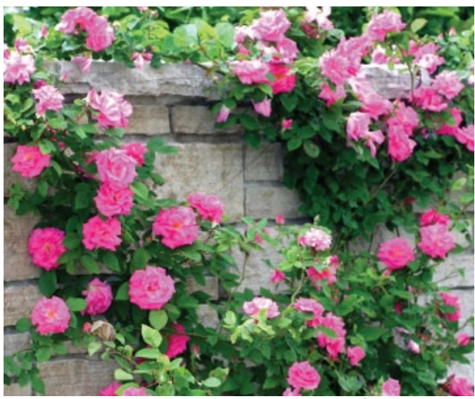
Pink climbing Rose seeds available at ufseeds.com

Once the seedlings have sprouted, transplant them into individual pots. Do not touch the roots during this process. Use a spoon if needed to transplant the seedlings to keep from touching the roots. Be sure the seedlings have plenty of light, and it is suggested to use a fungicide to prevent fungal diseases from attacking the roses at this stage of their growth. Take care to not overwater the rose seedlings. Plant the roses outside in the spring and once they are established, water them weekly. Water the roses close to the soil and not overhead to prevent fungal diseases. Mulch around the plants to retain moisture and prevent weeds. Pruning is another necessary tactic to produce the best rose bushes. Pruning takes